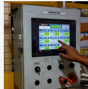
AUTOMATION AND CONTROLS