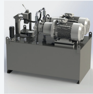
HYDRAULIC POWER UNIT